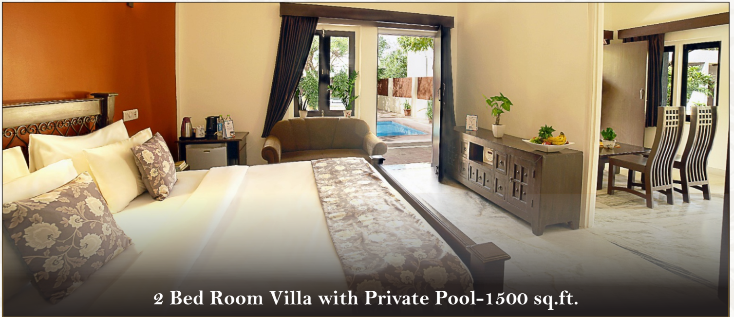
2 Bed Room Villa with Private Pool-1500 sq.ft.