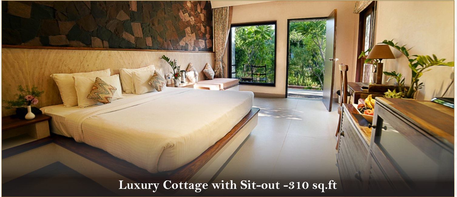
Luxury Cottage with Sit-out -310 sq.ft