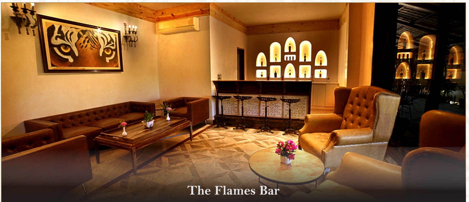
The Flames Bar