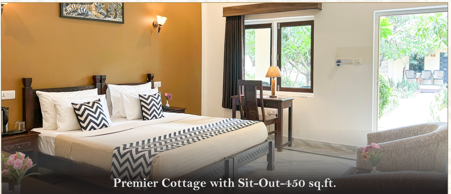
Premier Cottage with Sit-Out-450 sq.ft.